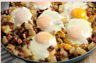
Potato and Ham Skillet With Eggs